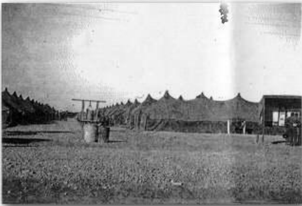
File photo Camp Lucky strike

During this time Battle of the Bulge occurred Completely equipped and loaded on board ship destination changed from the Pacific to the east coast then to the European theater early December shipped out from New York Harbor sailed to Le Havre France then taken to Camp Lucky Strike in Janville France waited for orders early February Traveled by French boxcars and trucks to the front.